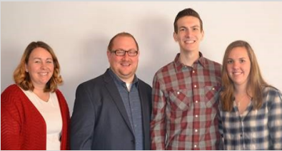
CCCC Pastors & Office Staff

106 West Church Street, Cambridge City, IN 47327 (765)478-5123