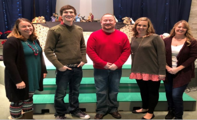
CCC Pastors & Office Staff

106 West Church Street, Cambridge City, IN 47327 (765)478-5123 ccc@4c.church