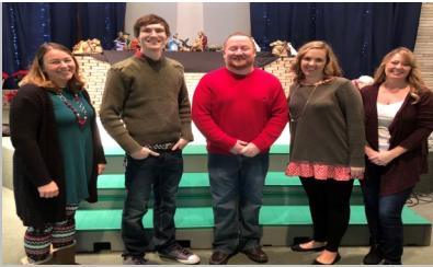
CCCC Pastors & Office Staff

106 West Church Street, Cambridge City, IN 47327 (765)478-5123 cccc@4c.church