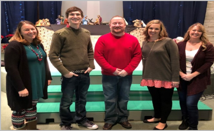
CCCC Pastors & Office Staff

106 West Church Street, Cambridge City, IN 47327 (765)478-5123 cccc@4c.church