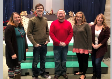
CCCC Pastors & Office Staff

106 West Church Street, Cambridge City, IN 47327 (765)478-5123 cccc@4C.church